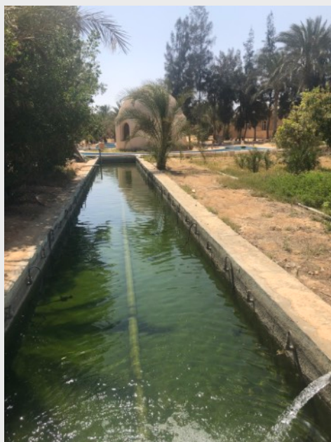
In the monastery of Anafora

It will take place in the magnificent monastery of Anafora, in the desert between Cairo and Alexandria. It will be partly transmitted by video-conference. The date will be determined according to the health situation in this country. For more information and if you wish to participate, please consult our website.