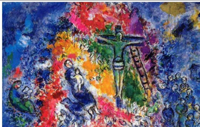
Image: The Tree of Jesse according to Marc Chagall, extract.

"I am above you to bless you, with you to drive you, in your midst to encourage you and in you to renew yourself".